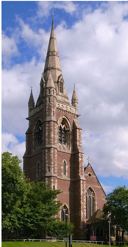
Moseley, St Anne