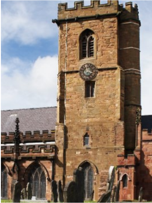
Handsworth, St Mary