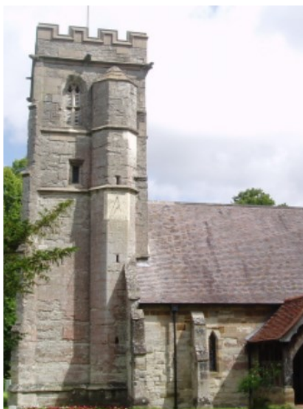
Packwood, St Giles