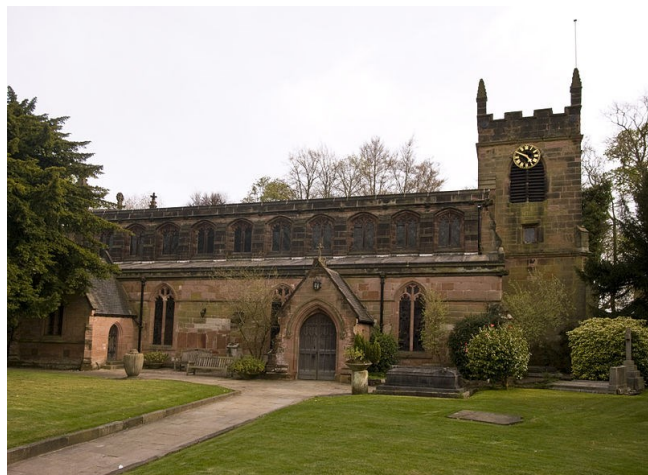
Edgbaston, St Bartholomew