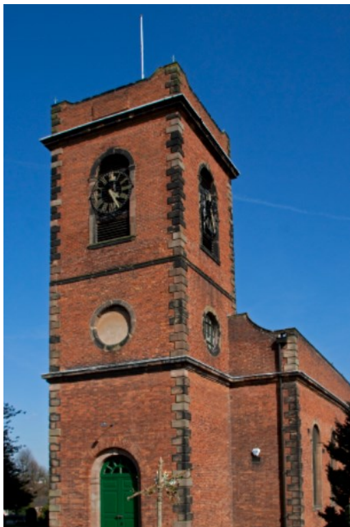
Smethwick, Old Church