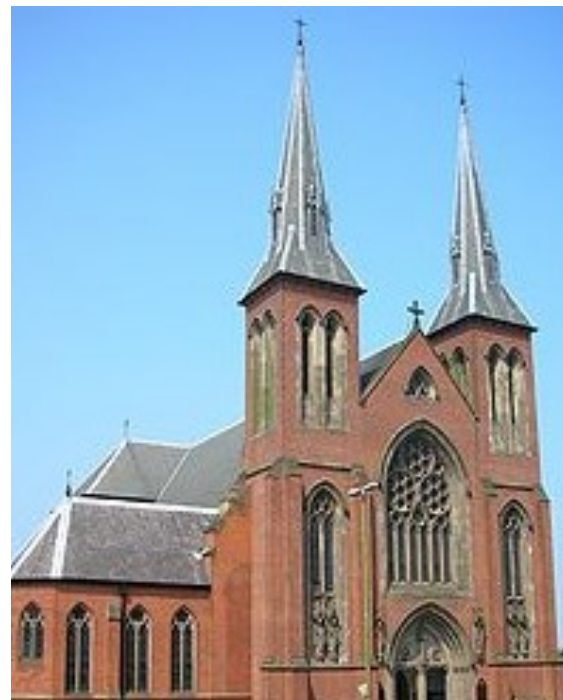
Birmingham, St Chad's Cathedral

Bells: 12, 31-0-21 in D PN: none SR: 08.30–09.00; 2nd & 4th 10.15–10.55 Contact: Gill Postill 0121 744 6217; gill42@hotmail.com