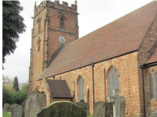
Curdworth, St Nicholas