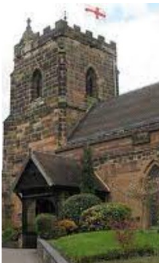
Sutton Coldfield, Holy Trinity