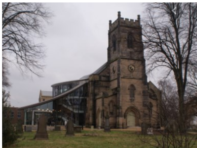
Erdington, St Barnabas