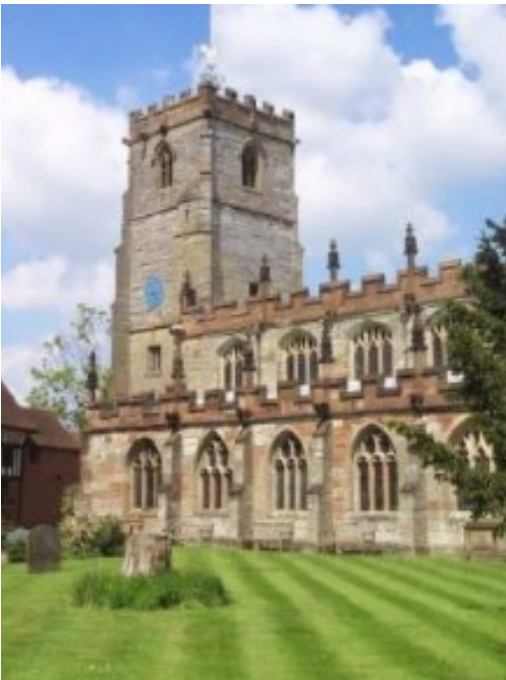
Knowle, SS John the Baptist, Lawrence & Anne