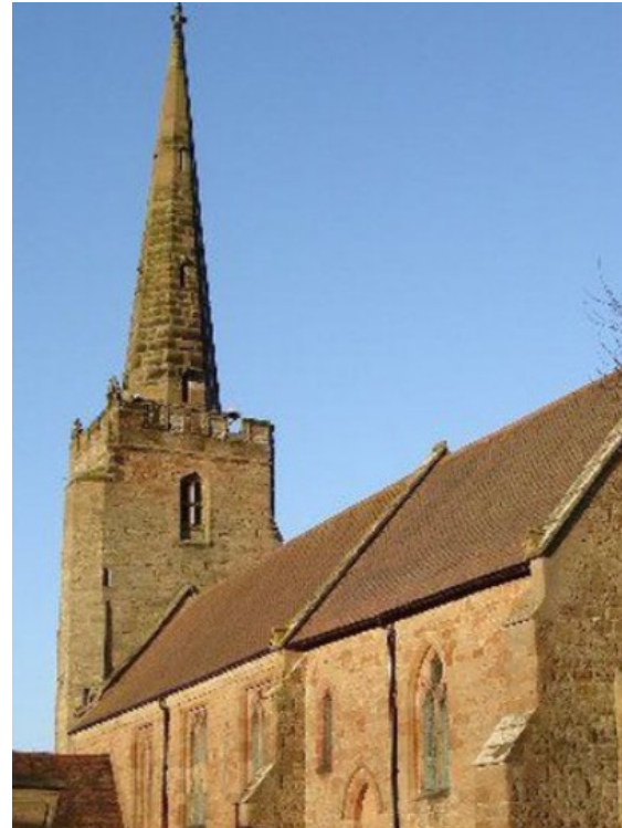
Bickenhill, St Peter

Bells: 6, 9-2-0 in A PN: none SR: none Contact: The Vicar