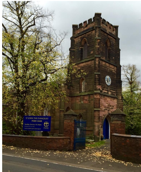
Perry Barr, St John the Evangelist